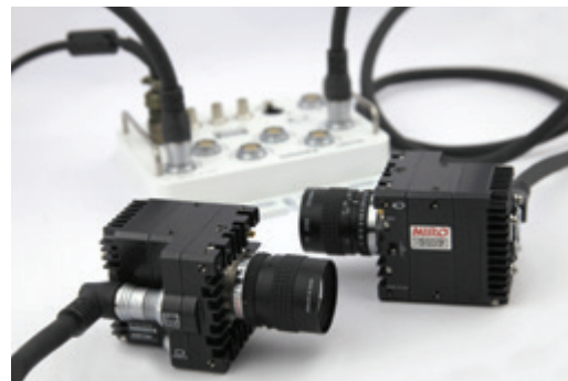
Phantom Miro C210J and Junction box

Small, light, and rugged, the Miro C210J is designed for tough and difficult situations , such as automotive on-board applications. It uses just a single cable to connect to the Miro Junction Box (JBox). The Miro C210J is also versatile. It can be connected to a Remote Control Unit (RCU), and also has a DIN 1.0/2.3 connector for HD video.