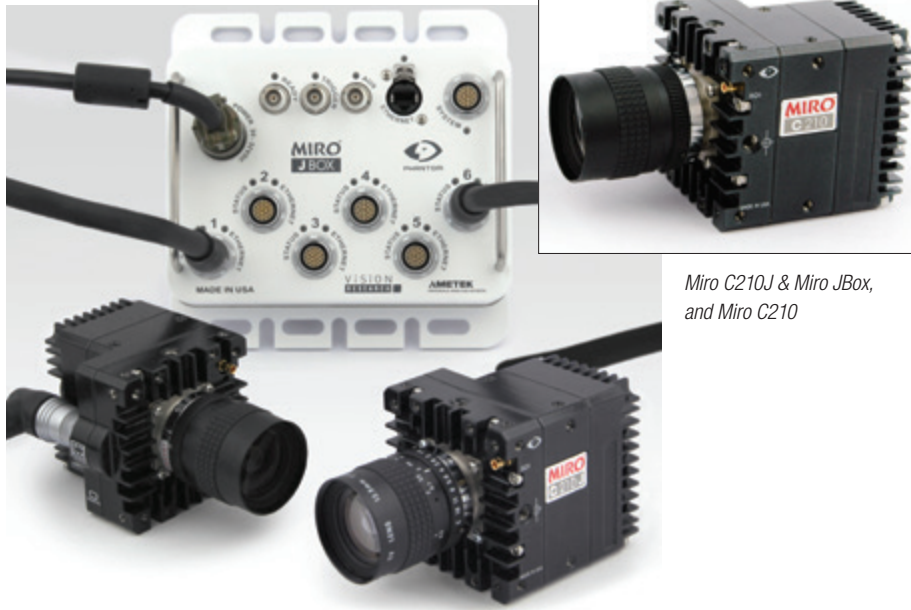
Miro C210J & Miro JBox, and Miro C210

* Measured according to ISO 12232:2006 method