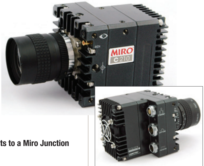
Phantom Miro C210

For maximum flexibility, the Miro C210 also connects to a Miro Junction Box via a Miro Capture cable.