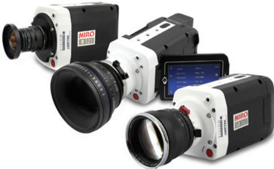
Phantom Miro LAB-, LC- and R-Series Cameras