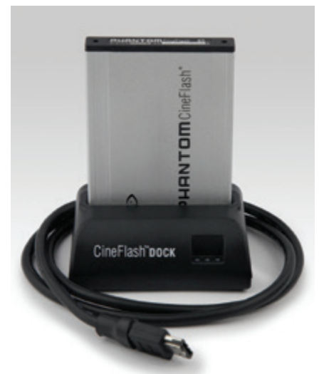
Phantom CineFlash Drive & CineFlash Dock