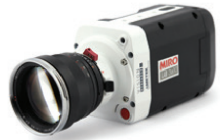
Phantom Miro LAB3a10

Our Miro camera line is supported by Vision Research's Global Service and Support network offering AMECare Performance Services from multiple sites around the globe. Maximize the value of your Phantom camera by learning more about our service and support options at www.phantomhighspeed.com/PhantomZone .